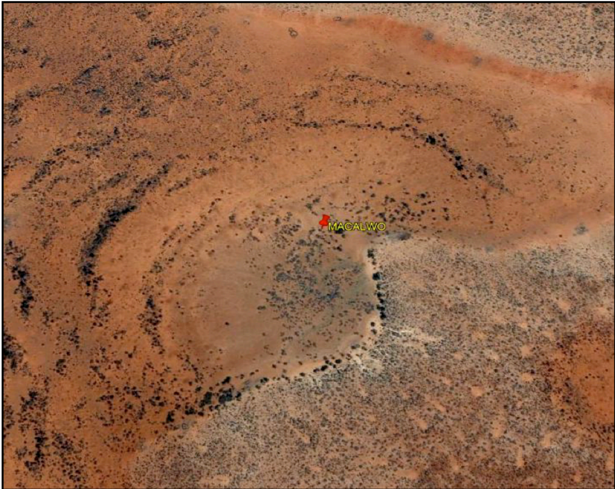
Figure 1: Project Site Map of Macalwa

The Project location is Macalwa area that is located in between Awrculus and Qalaanqal Villages, Garowe district in Nugal region. The site is approximately 55km East of Garowe. The geographical coordinates of Macalwa site is approximated as 48.62577 East longitude and 7.97343 North Latitude of 653m a.s.l. Location map is as shown below: